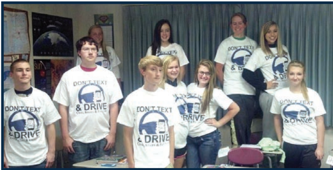
Drivers Education students sporting their new CRAIG, KELLEY & FAULTLESS Don't Text and Drive T-shirts.