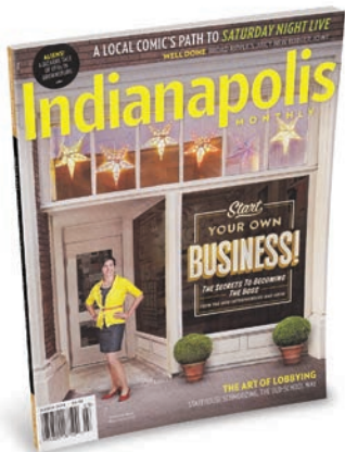
The March 2014 issue of Indianapolis Monthly Magazine