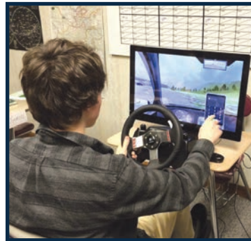
Quality Driver Education students using the Don't Text and Drive simulators in Pendleton, Indiana.